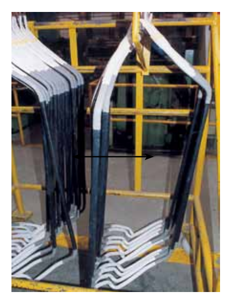
We recommend to protect them from heat, humidity and at an ambient temperature.

Internet : www.e-bourgeois.com E-mail : info@e-bourgeois.com